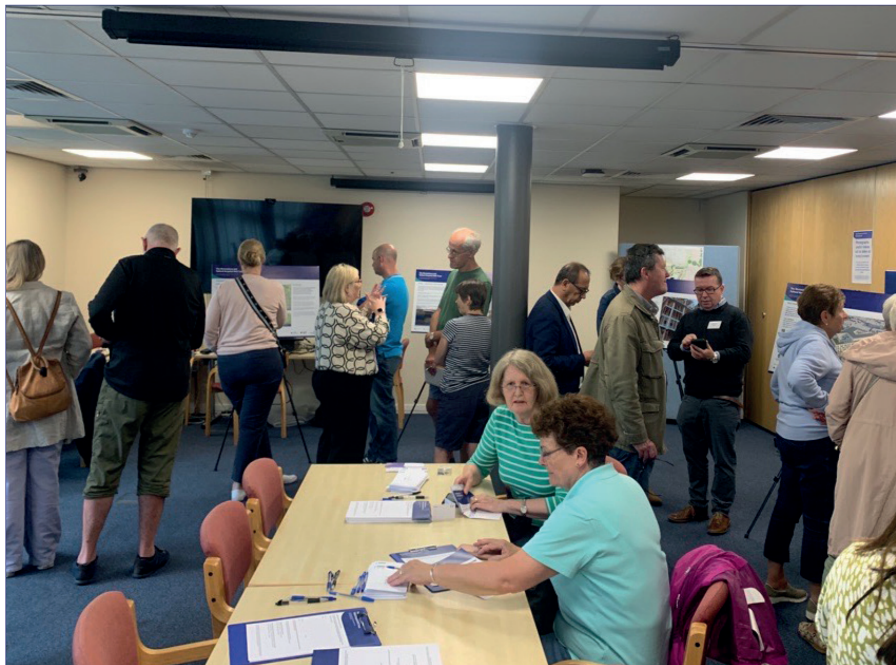
Previous consultation event on the Hospitals Transformation Programme

www.shropshiretelfordandwrekin.ics.nhs.uk/hospitals-transformation-programme/