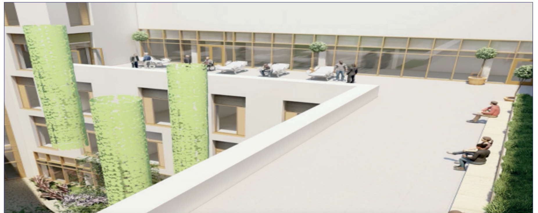
An indicative image of what the sky deck could look like