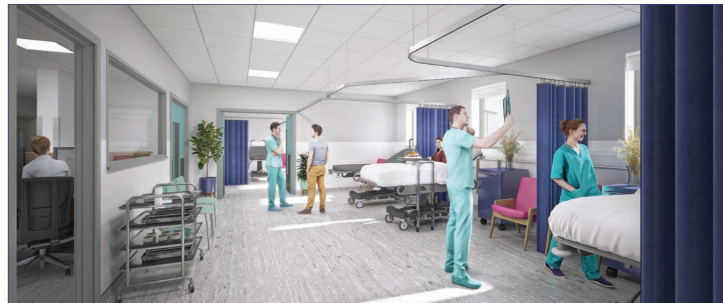
CGI of Planned Care Hub at Princess Royal Hospital