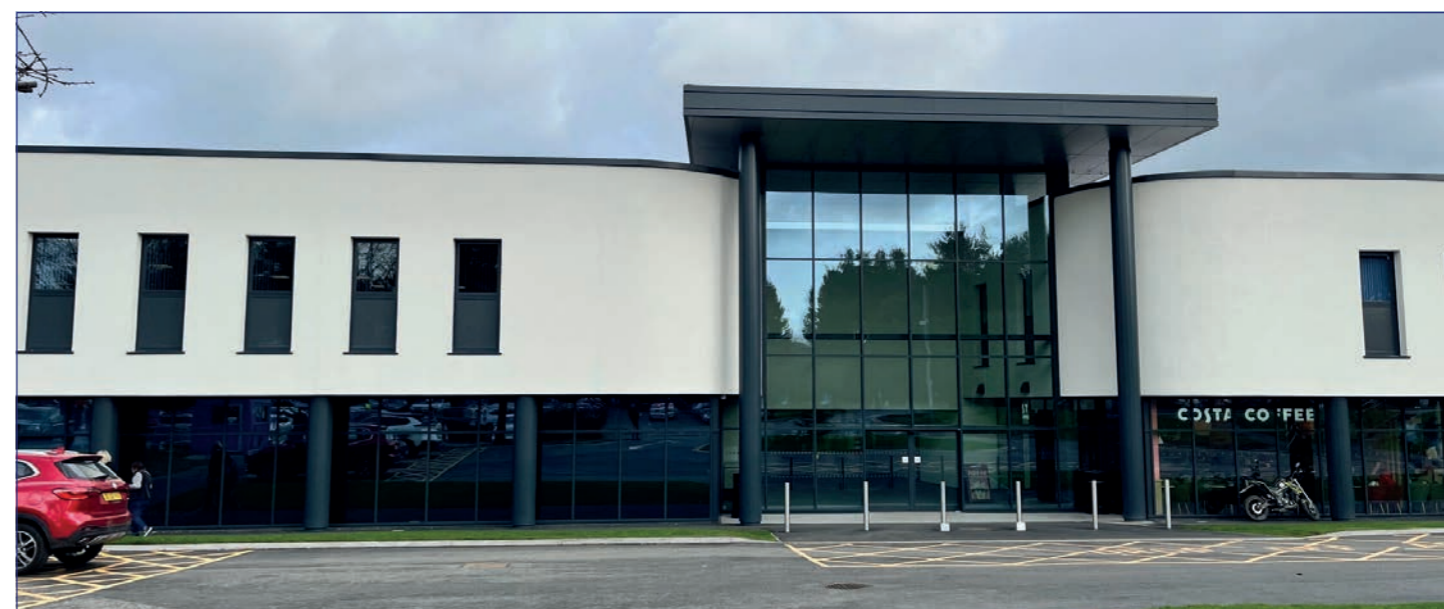
The new entrance of Princess Royal Hospital in Telford