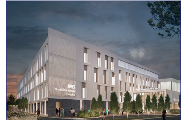
CGI of new facilities at RSH including a new front entrance

The café and waiting area will lead off from the atrium with views into a new courtyard.