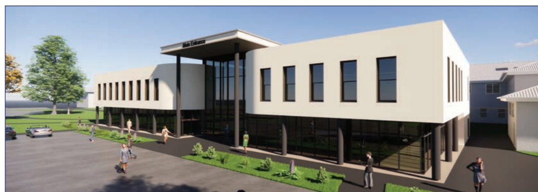
CGI of improvement plans, including four new theatres, at the Princess Royal Hospital

The cancer treatment centre is a new facility and is an expansion of the current service at the Royal Shrewsbury Hospital. It supports the wider healthcare ambitions of providing care close to home, where possible, for those who may be receiving chemotherapy to access the regular care they need. Currently 40% of cancer patients being treated in the catchment area, served by The Shrewsbury and Telford Hospital NHS Trust, live in Telford.