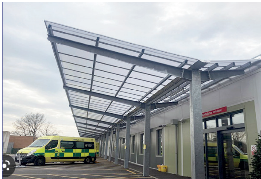
Illustrative canopy planned for expanded ambulance waiting area