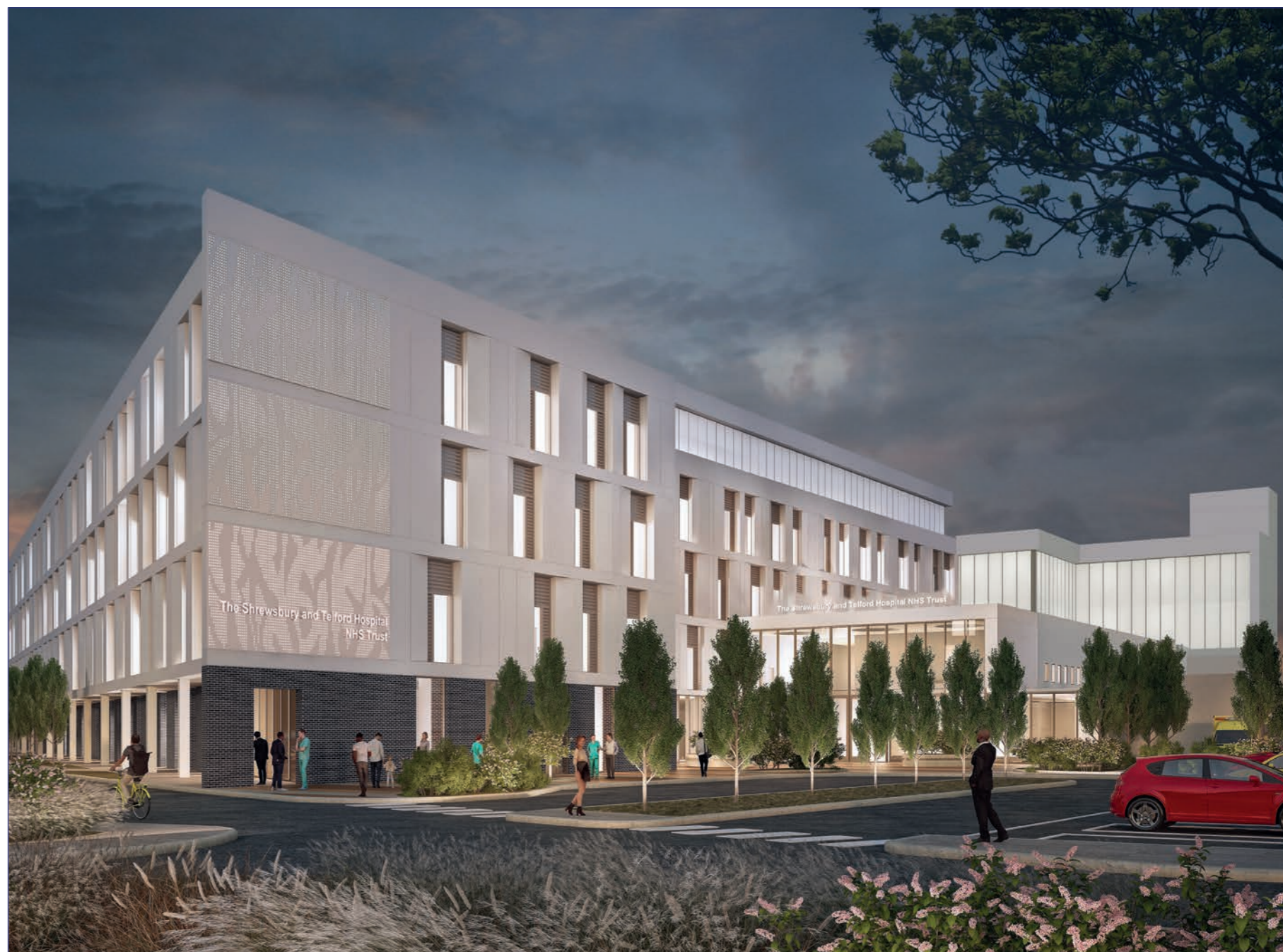
CGI of new facilities at Royal Shrewsbury Hospital